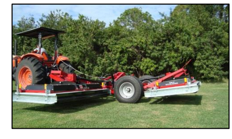
Pro Lift-N-Turn™ system in use.